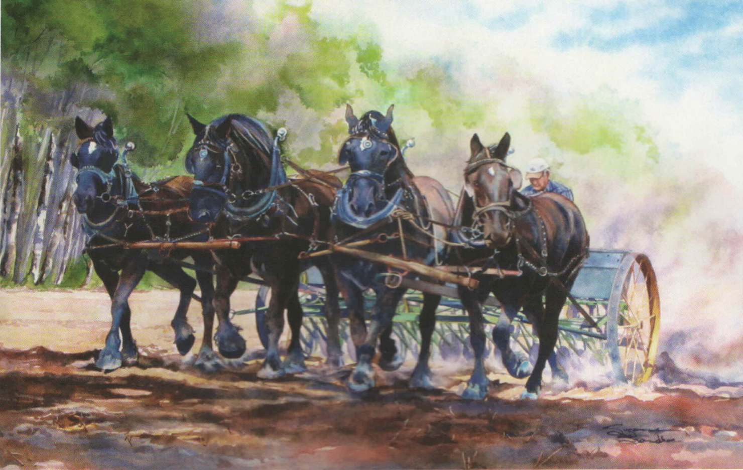
16 X 26.5 WATERCOLOUR