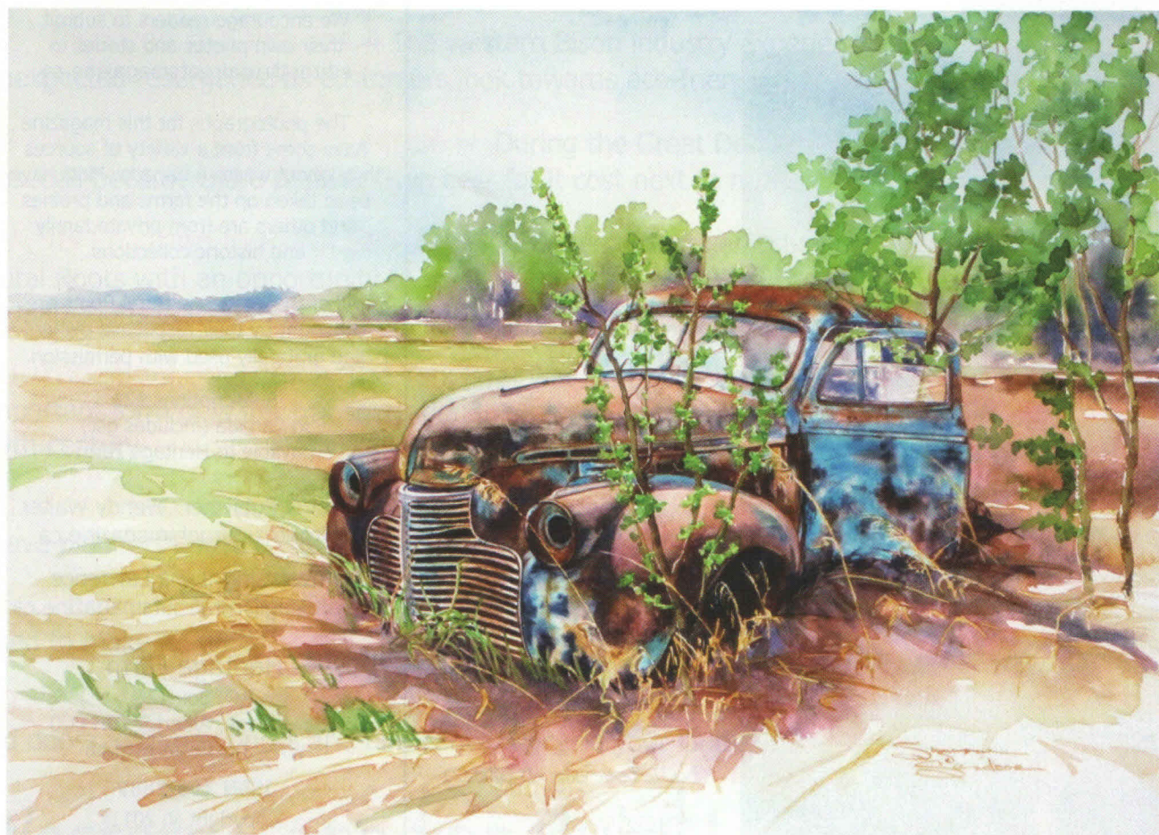
No Spring Chicken

Join us as we explore the Horticulture & History of north western Canada. Everything from hardy prairie plants to the pioneers who cleared the land before us. We are happy to meet writers and artists, both amateur and professional who share the same passion for the history and culture of rural living. We invite you to share your own stories with us and we look forward to hearing from you in the future.