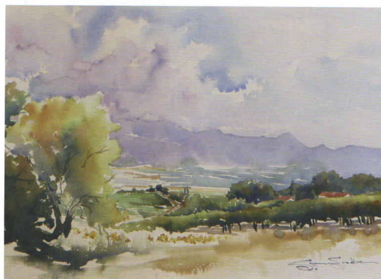
Grapes for the Wine, Provence, France, Watercolours, Suzanne Sandboe