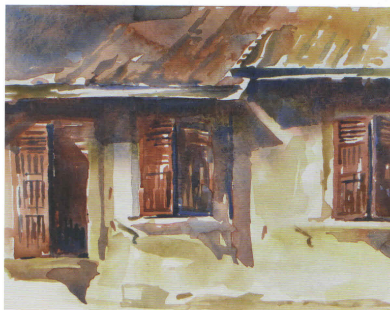
Windows of Arles, France, Watercolour, Suzanne Sandboe